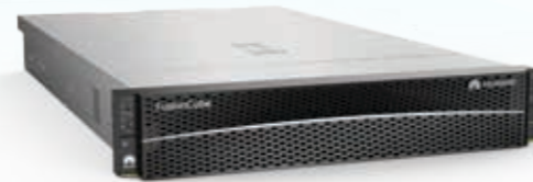
FusionCube 2000 2U 1-node

FusionCube for Cloud supports different hardware configurations requirements of different services for compute, storage, and I/O resources. The FusionCube HCI applies to cloud computing scenarios and is an ideal choice for deploying the IT infrastructure of cloud data centers.